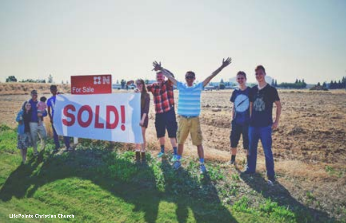
LifePointe Christian Church

Since 1953, CDF Capital has helped hundreds of churches and ministries overcome the challenges of financing growth projects.